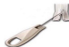
Zipper & Button Enabler

Top Lip Extensions (2 each) extends the Advantage Trifold, Suitcase Advantage, and Signature ramps. These are optional plates that increases the standard 3" ramp lip to 9", allowing the ramp to clear the rear bumper of SUVs and vans. Simply attaches to the top lip.