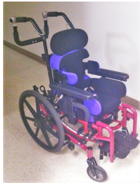
Spree 3-G Pediatric