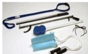
6 pc Rehab Kit

Rehab Kit, after hip replacement, includes 6 items; 1 each: Lt-Wt Reacher, contoured long-handled bath sponge, semi-rigid sock-aid w/cord handles, Leg Lifter, plastic hvy-dty shoehorn, and a pair of elastic shoelaces.