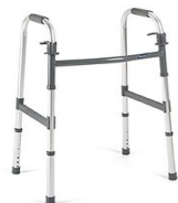
Dbl Trigger Walker

Durable plastic, 2 cup holders, easy to install. fits most walkers 16x12.