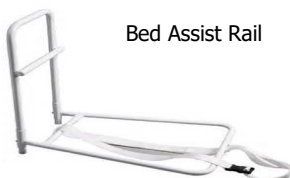
Bed Assist Rail

Steel handle/cane is mounted on board & secures between mattress & box spring. Can be attached to home or hospital bed. Adjusts from 19" to 22" high. Includes attachable organizer w/four pockets.